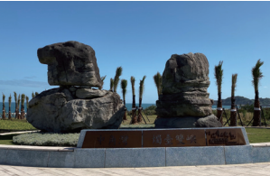
▲ Twin Candlestick Islets sculpture

Jhongjiao Bay is located close to kilometer marker 39 of Provincial Highway 2. It has a crescent-shaped sand beach, and due to northern winds throughout the seasons, beautiful waves rolling in are a common sight. This is one of the best spots for surfing on the North Coast. In order to improve the surfing environment at Jhongjiao Bay and to promote tourism on the North Coast, and also taking into consideration that surfing will be included as a sport in the 2020 Summer Olympics in Tokyo, Jhongjiao Bay is now being developed into an international base for training surfing talent. For this purpose, the Jhongjiao Bay International Surfing Base has been established close to the beach.