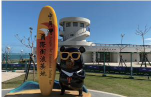
▲ OhBear mascot sculpture